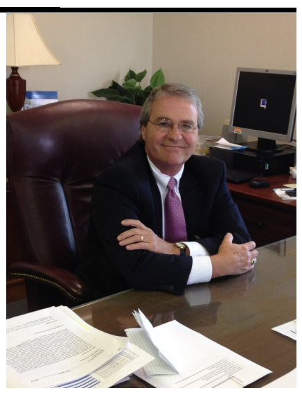
WCGRH is an equal Opportunity employer