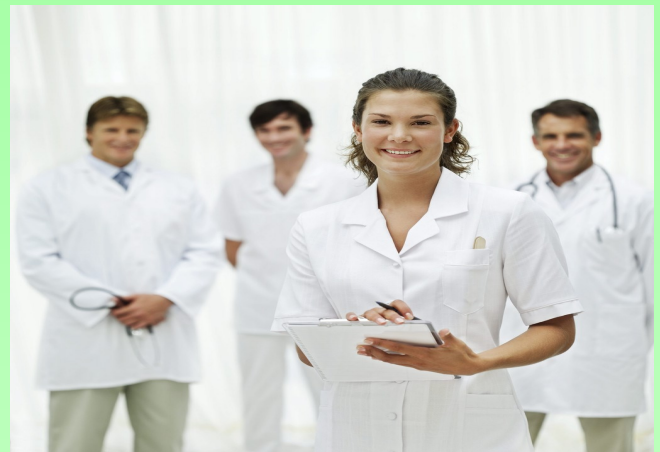
Recovery is Possible