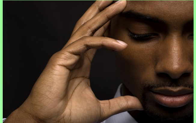
Depression affects all ages, races, ethnic & socioeconomic groups