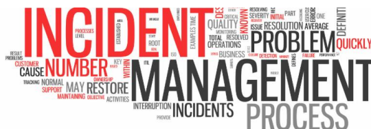
Image COVID-19 Incident Reporting Changes

Director, Office of Incident Management and Compliance Division of Accountability and Compliance