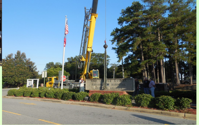
Photos of New WCGRH sign being installed